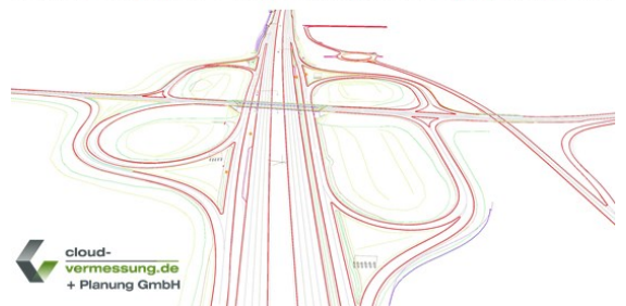
CAD lines of a highway section done by Cloud-Vermessung + Planung GmbH